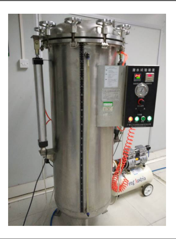
***End of report***